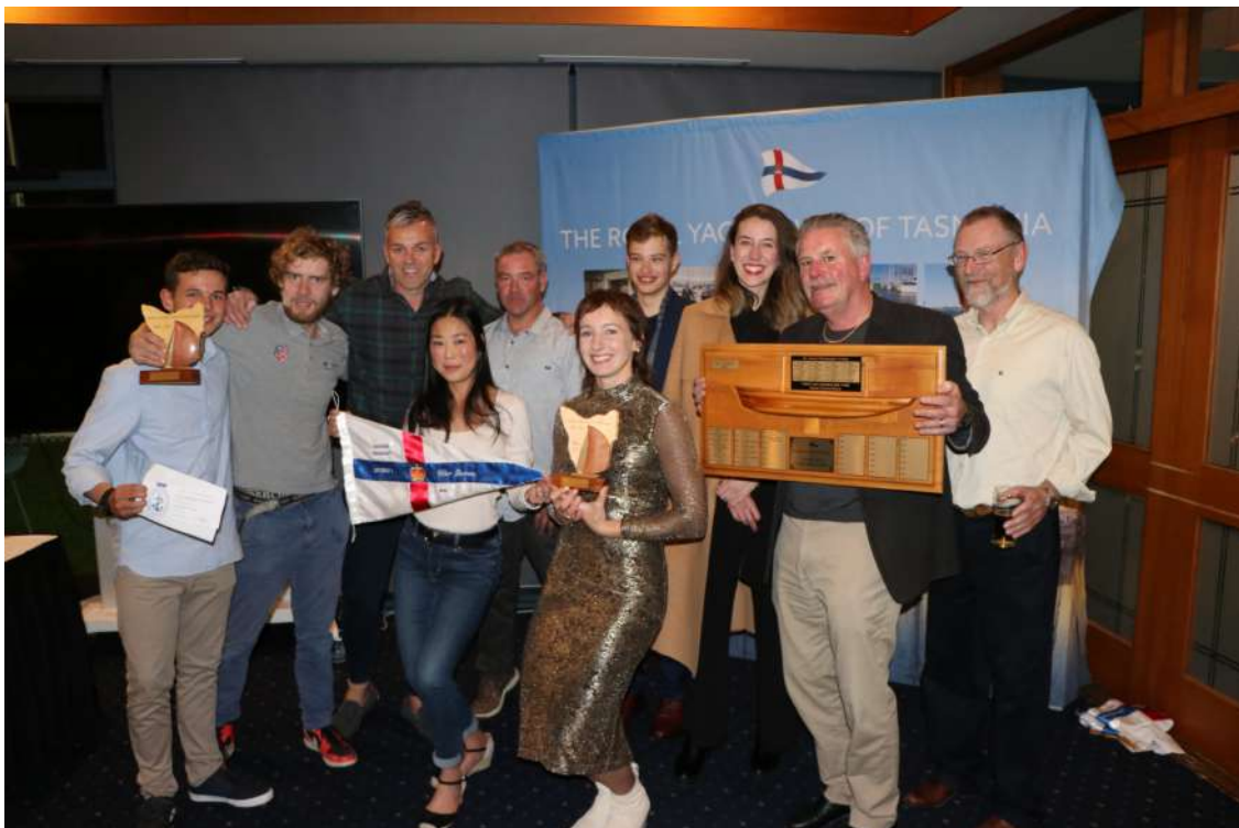
Wargames Crew.