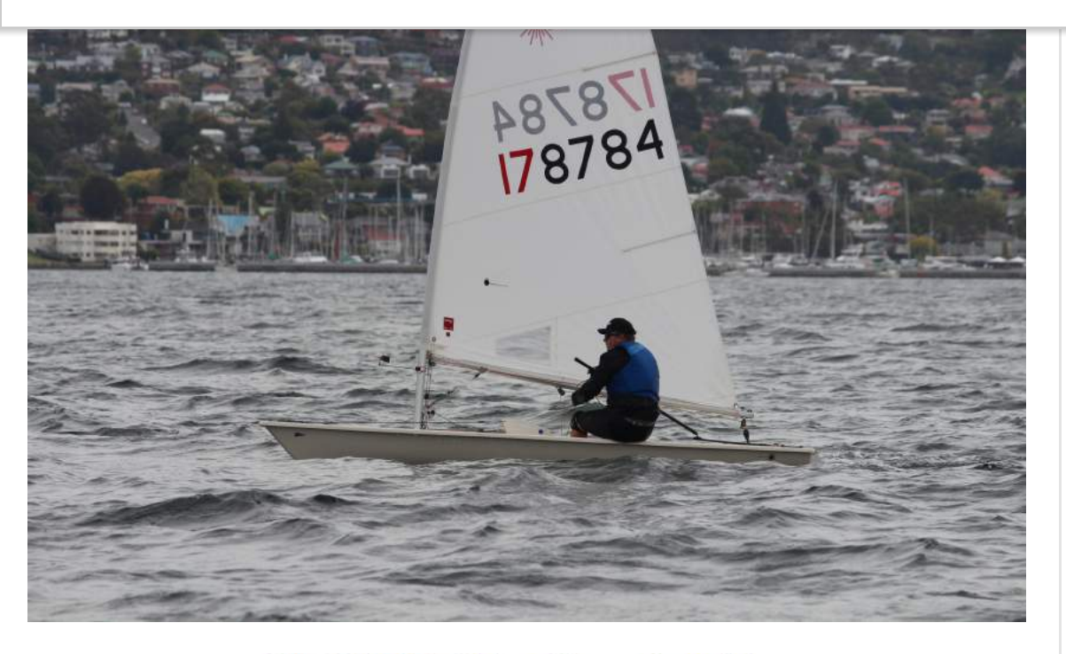
2023 TDLA State Championships