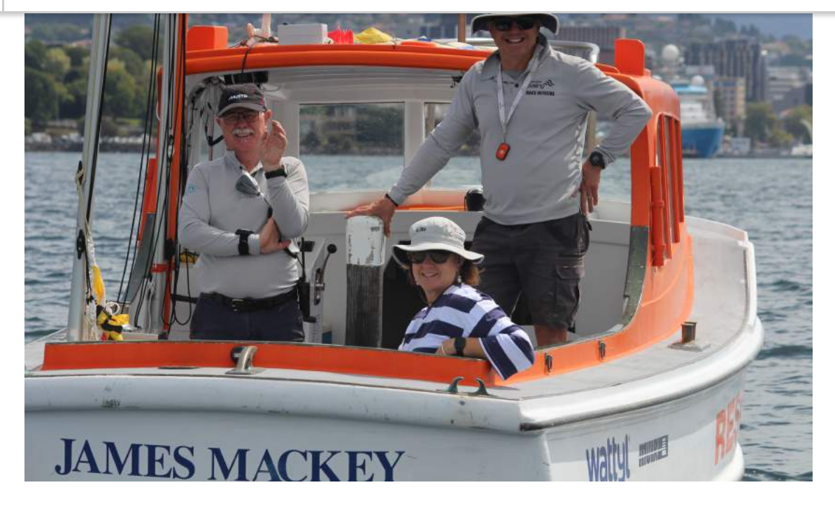
Race Committee of the Tasmanian Laser State Championships 2023.