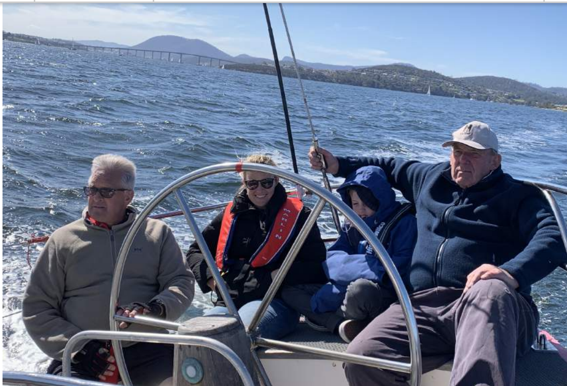
Photo:- Twilight sailing on NATELLE TWO